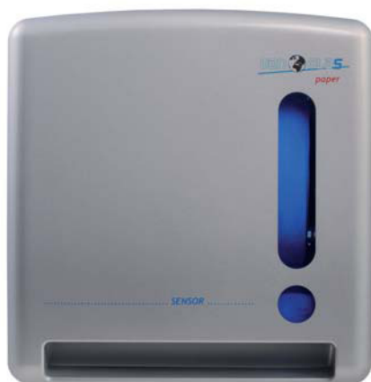
metallic silver skaffevare

Motion sensitive roll-style paper towel dispensers are available in the following colours: