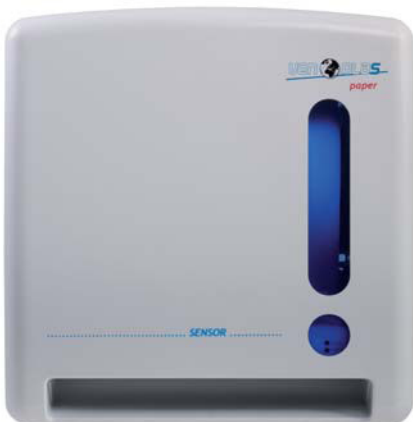
light grey skaffevare