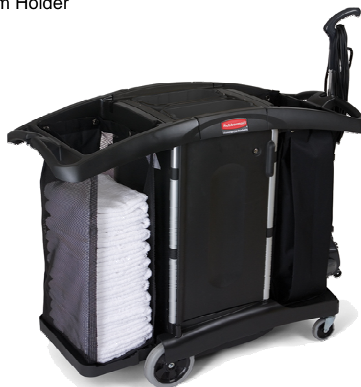
Shown with Accessories