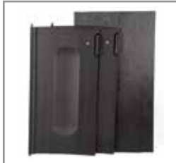
LOCKING DOOR KIT