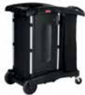
COMPACT TURNDOWN (6-8 ROOMS) FG9T7700BLA