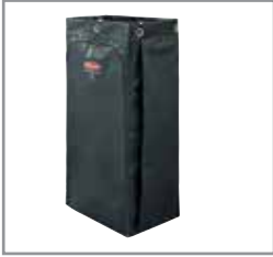
113L VINYL BAG WITH ZIPPER