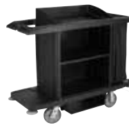
LARGE HOUSEKEEPING CART FG618900BLA (1 fabric bag included)