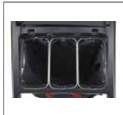
TRIPLE WIRE BAG HOLDER