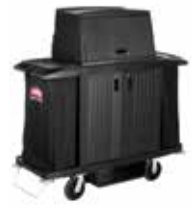
LARGE HOUSEKEEPING CART WITH DOOR KIT AND SECURITY HOOD CONCEAL AND SECURE CLEANING SUPPLIES