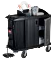
MEDIUM HOUSEKEEPING CART WITH DOOR KITS PROVIDES DISCREET AND SECURE AREA