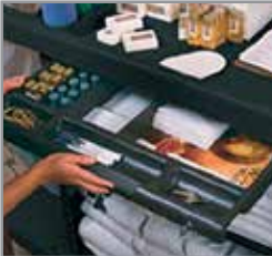
UTILITY DRAWER WITH LOCK