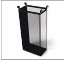
SIDE-LOAD LINEN BAG