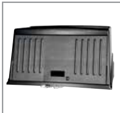
GLASS RACK HOLDER