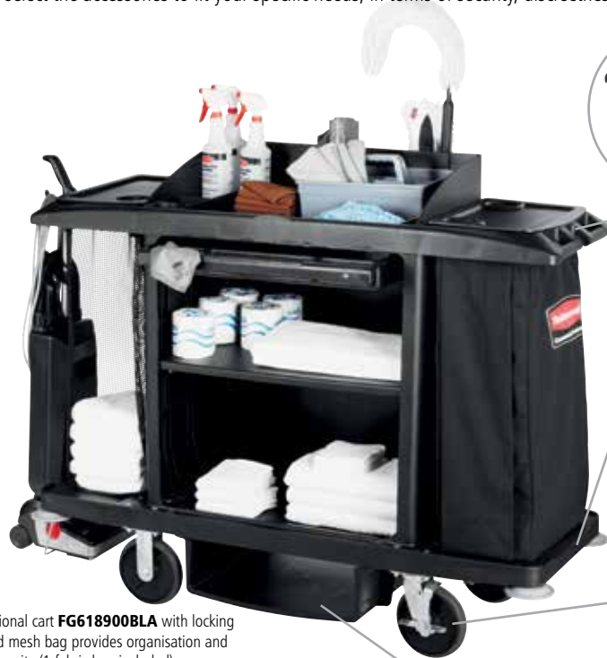
Large Traditional cart FG618900BLA with locking drawer and mesh bag provides organisation and security (1 fabric bag included)

The classic styling of the Traditional Carts offers smart design to serve a multitude of housekeeping requirements. Choose between one of two cart sizes – medium or large - and select the accessories to fit your specific needs, in terms of security, discreetness or organisation. Fully equipped, they can service up to 16 rooms.