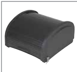
LOCKING SECURITY HOOD