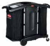
COMPACT FOLDING CART (10-12 ROOMS) FG9T7600BLA