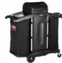
HIGH SECURITY COMPACT CART (10-12 ROOMS) FG9T7800BLA