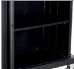
ADJUSTABLE SHELF KIT