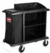
MEDIUM HOUSEKEEPING CART FG619000BLA (1 fabric bag included)